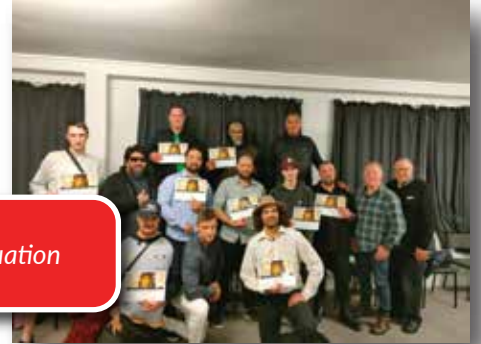
Term 2 Graduation

alone think they are worthy to secure it. It is so rewarding being party to transformational life change in people's lives on a weekly basis. To see these brave souls, stand up to 'giants of negativity' in their lives that have controlled them for years and watch them fall is a beautiful sight to behold.