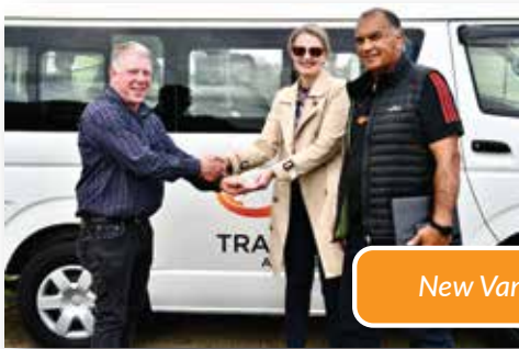
New Van Handover

In winter 2022 we added a van to our small fleet of vehicles. The signage is like a flag advertising who we are, it's impossible to miss it zipping in and out of town. It has been extremely valuable providing transport for the men's life group program getting them around the district to do jobs and visits to the gym to work out. The guys are very proud of their van, and it is well looked after by them all.