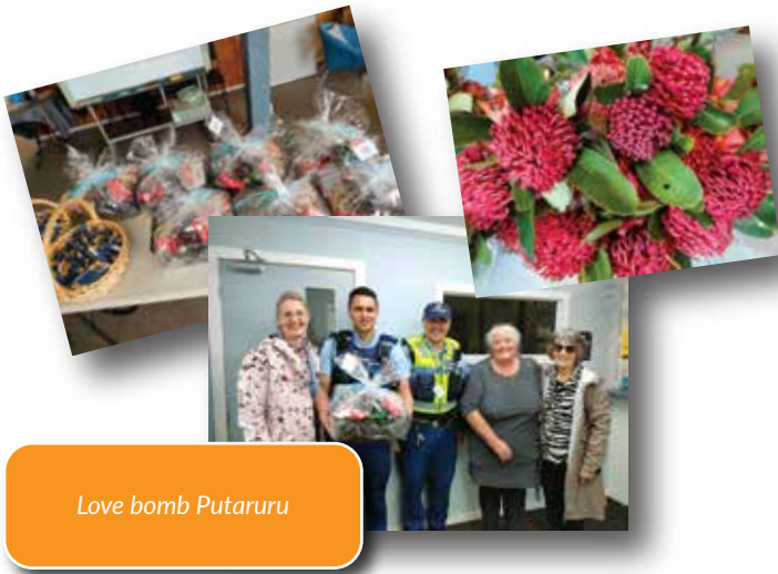
Love bomb Putaruru