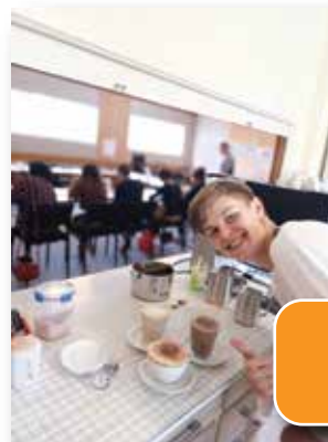
Barista Training Course

I happened to be downstairs and watched as he got out of the car at Transform. He was jumping around like a jack rabbit in a veggie patch with his hands on his head, obviously still in awe of what he had experienced. I gave him a high 5 when he told me his verdict. I then told him that I had a team of people praying for him. Both his and his partners eyes lit up and he enthusiastically said, "I felt all of it!" As he walked away, he looked like he was ten foot tall. He proudly told the men at the evening group his good news and a hearty applause followed. Miracles do still happen.