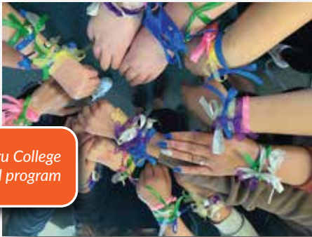
Putaruru College SHINEgirl program

Our after-school children's program Heroes and Giants had a couple of police officers join the fun this past week. They made an appearance and stayed to play games and get down on the children's level. It is important to us that even the children can build a positive relationship with the police instead of seeing them as the guys who take away their family members. If relationship can be built here, then when they need help, they have someone they already relate to who can assist them. Our local officers are very busy, but we are grateful that they made the time to pop across the driveway to participate.