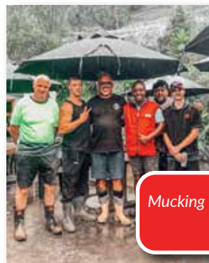
Mucking in at the Hawkes Bay vineyard.